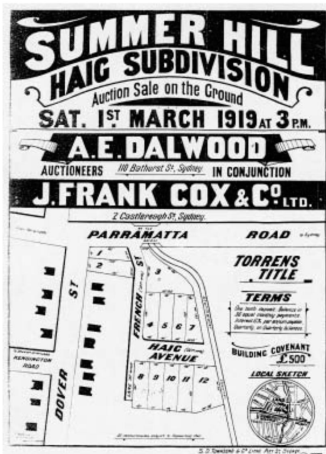
Above: The advertising leaflet which included the plan for the Haig Subdivision put up for auction on 1 March 1919. Haig Avenue is specifically marked '66 ft wide'. Note that Frenchs Lane is here called French Street. It also provided rear access to the properties in Dover Street.